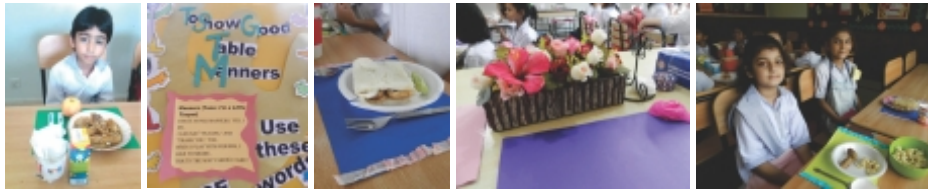
TABLE MANNERS ACTIVITY

Class II organized a Table Manners activity on 19th September, 2014. The purpose of this activity was to identify and practice the essential and necessary eating habits that should be demonstrated at the dining table.